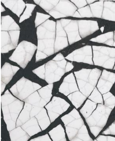
Eggshell in Black