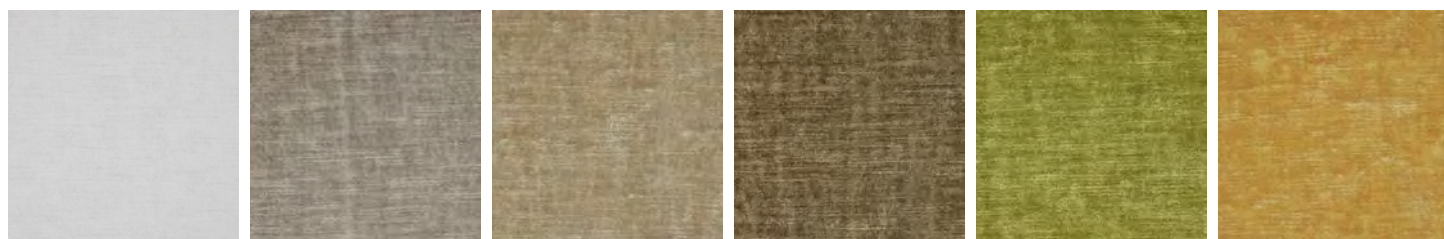
OPTIC PEARL ECRU SAND PISTACCHIO GOLD