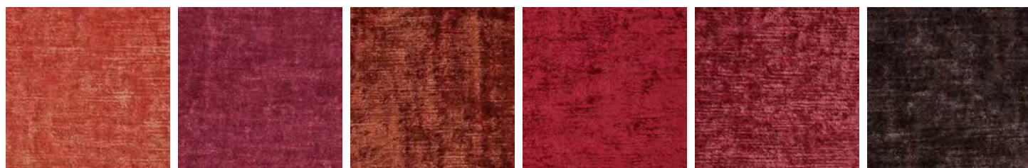
ROSE FUSCHIA RUST BISHOP BORDEAUX RAISIN