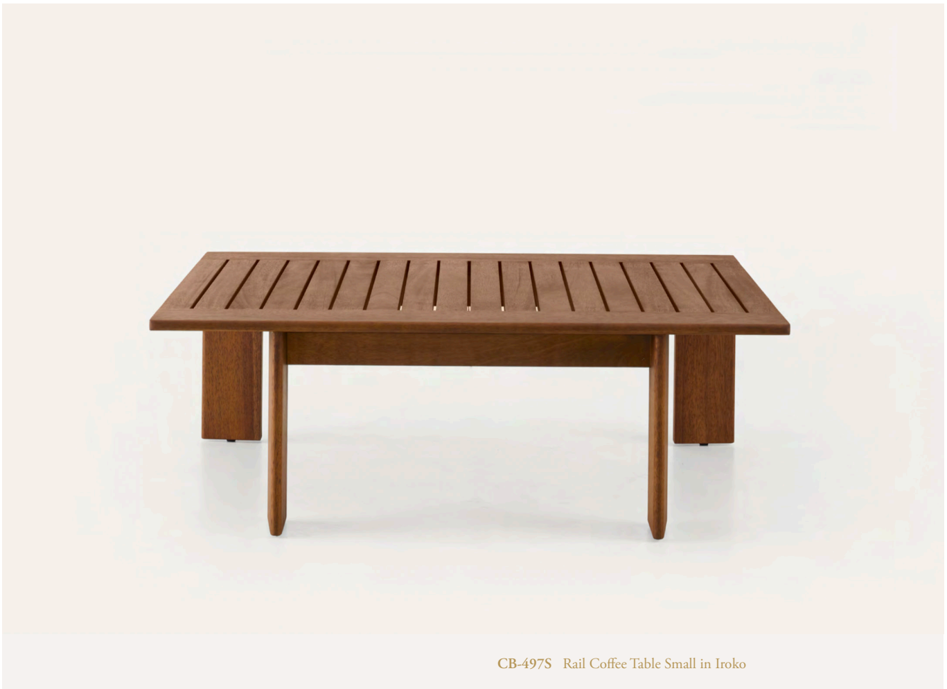
CB-497S Rail Coffee Table Small in Iroko